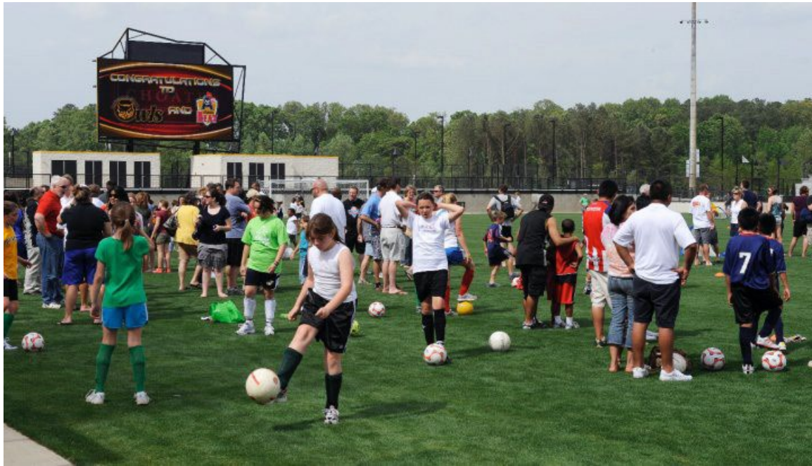
KSU Soccer Stadium Grand Opening

Georgia (May 3, 2010) — KSU Soccer Stadium Grand Opening