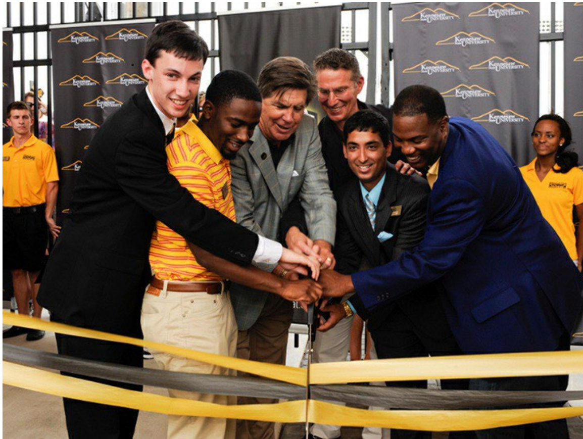
Grand opening of Kennesaw State University Soccer Stadium.

Georgia (May 5, 2010) — Grand opening of Kennesaw State University Soccer Stadium.