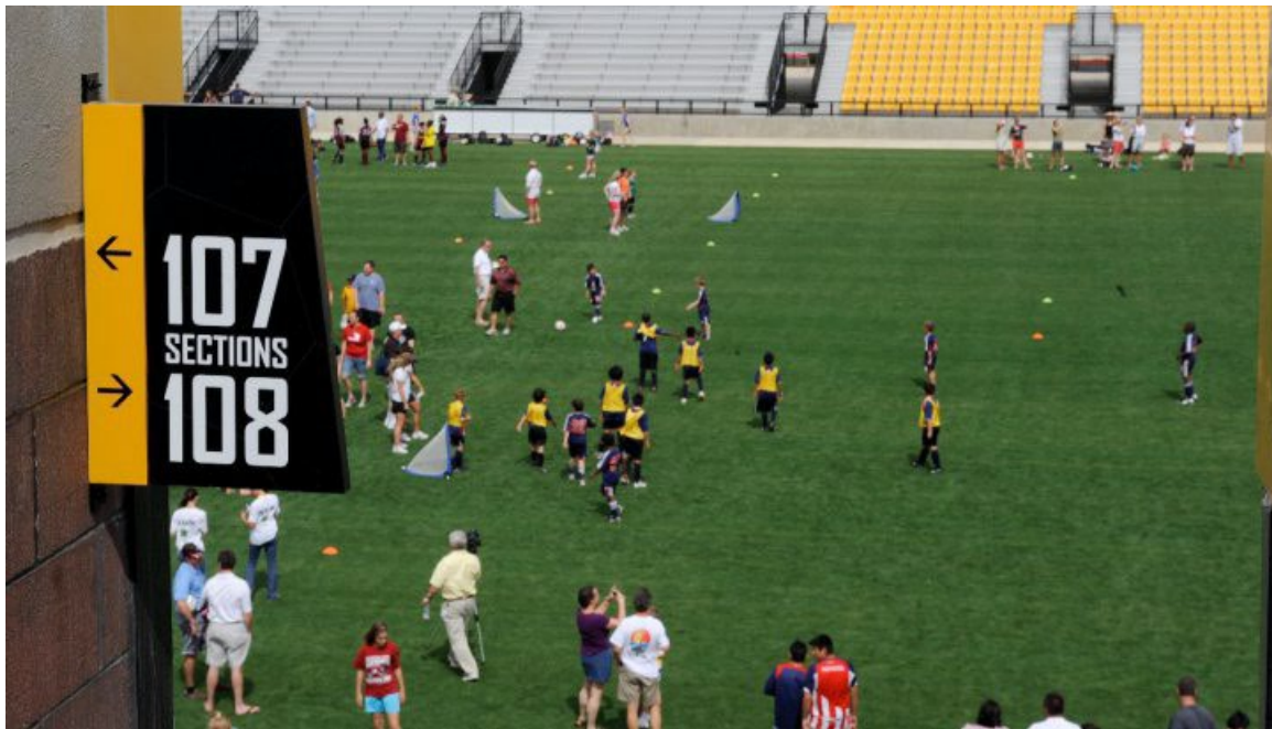
A view of the field.

Georgia (May 5, 2010) — A view of the field.