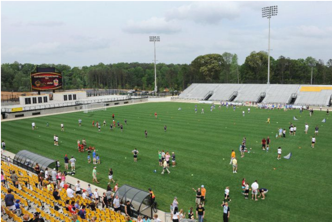
KSU Soccer Stadium

Georgia (May 5, 2010) — KSU Soccer Stadium