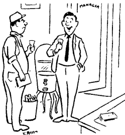
"The boss went wild about it! I guess in all the excitement of my promotion, I forgot to mention that the idea was yours."