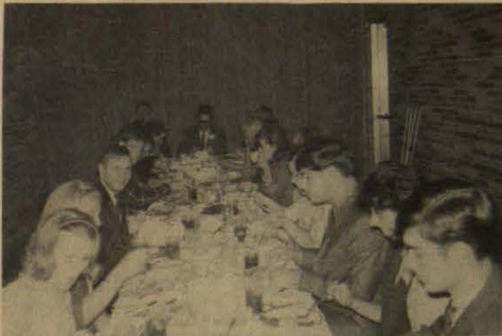
Publications Staffs Enjoy Dinner