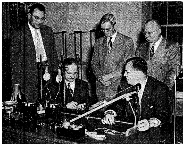
ECPD Committee Inspects STI