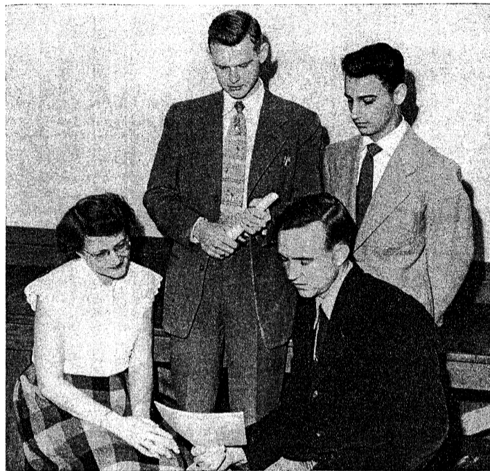
Officers of STI Tau Alpha Pi