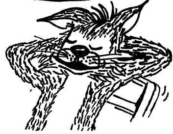
Even Cats Are at It!