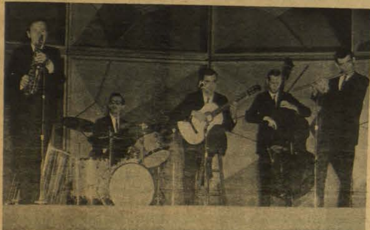
PAUL WINTER ENSEMBLE