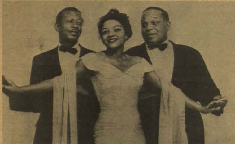
PORGY AND BESS SINGERS