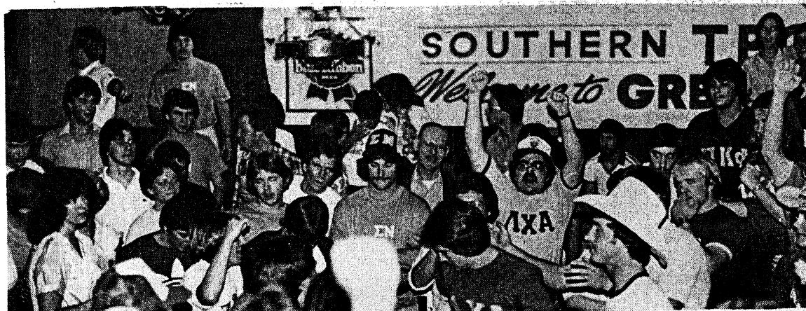
Everyone got into the fun at the arm wrestling tournament last Friday evening at Laural Vally Clubhouse during Greek Week festivities.