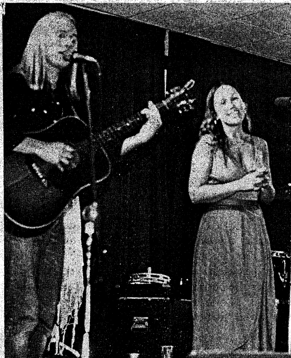
Hence, energetic listeners get their money's worth while passive listeners get bored.

As an avid concert goer, I have had ample opportunity to observe various listeners "getting off" at many different kinds of concerts from symphonic to acid rock. As a result of careful observations, I have concluded that listeners who communicate their feelings to the performers on stage and who respond to the performer's musical inquiries get what they prefer to hear.