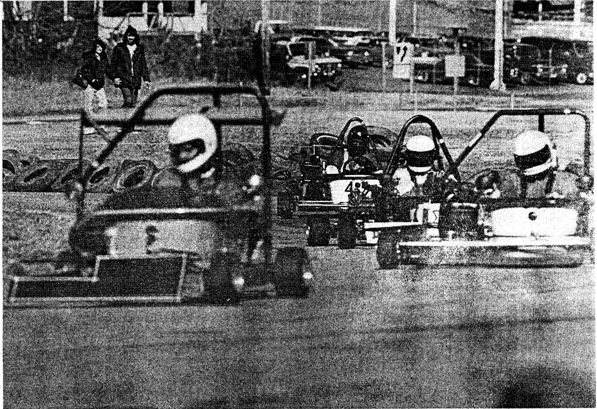
The 14th annual Bathtub Race Weekend will be held May 10 and 11. Be sure to catch this unique Southern Tech event.

The annual bathtub race originated in 1966 when fraternities raced tubs without wheels pulled by "pledge power" across a muddy track. In the years following, students added wheels for ground clearance and instead of using pledge power they designed motor driven tubs. The first racers were huge, composed of old car parts