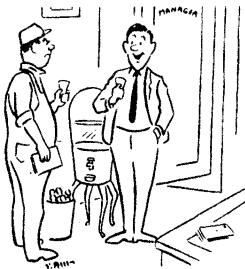
"The boss went wild about it! I guess in all the excitement of my promotion, I forgot to mention that the idea was yours."