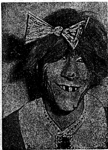
1-7 ENGINEER (Unidentified)

The authority stated that although some of the campus buildings would have to necessarily be torn down, not all the buildings would have to go. The ill-fated buildings listed by the authority to be demolished include the number one dormitory (wherein is housed the much-beloved cafeteria) and the goat shed (known to some as the administration building).