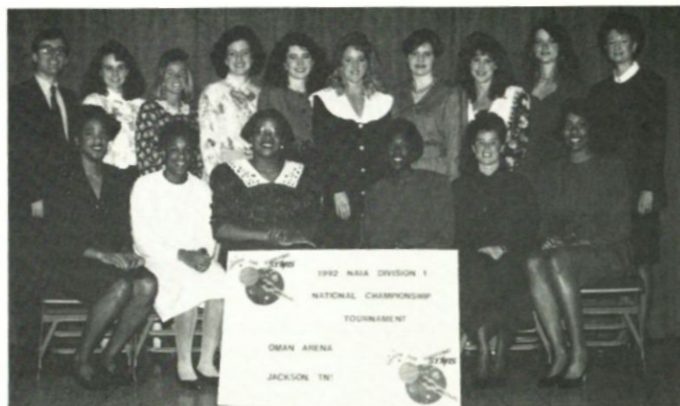
KSC earned its first National Tournament berth during the 1991-92 season.