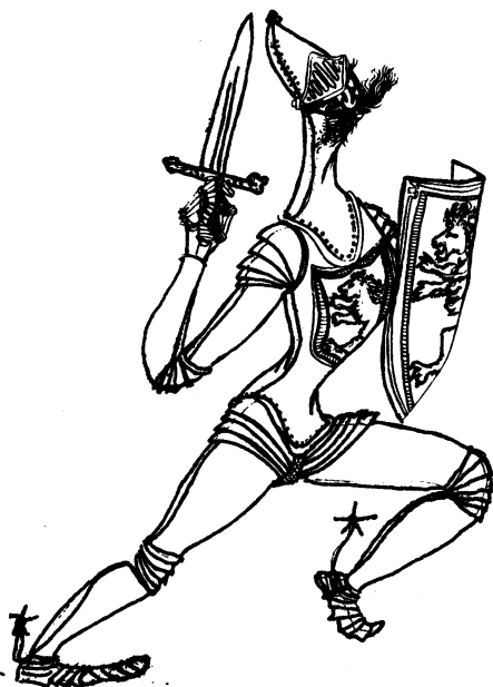
A Night Student ? A Knight Student !

With the coming of Spring an important event for your Student Government occurs-- student elections. This college needs some competent people to fill some positions in the S.G.A. The S.G.A. is appealing for your help in continuing the progress that has been make. If you have some spare time you can offer, and have at least a 2.0 overall average, please help your college. There are 25 positions open for election purposes, but there are many more students who can support the S.G.A. activities and help in other means. If you feel you can help Southern Tech's Student Government as a representative or officer please pick up a nomination form in the S.G.A. or LOG offices.